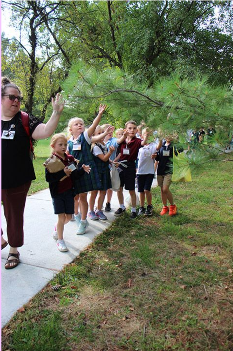
Kindergarten explored school grounds and the area around Trendwood Park during their "Nature Walk"