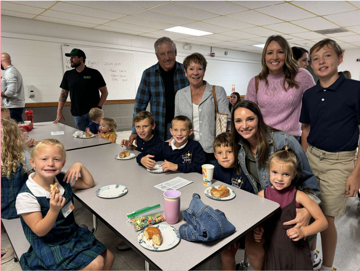
Families enjoying donuts during "Bring Your Loved One to Mass"